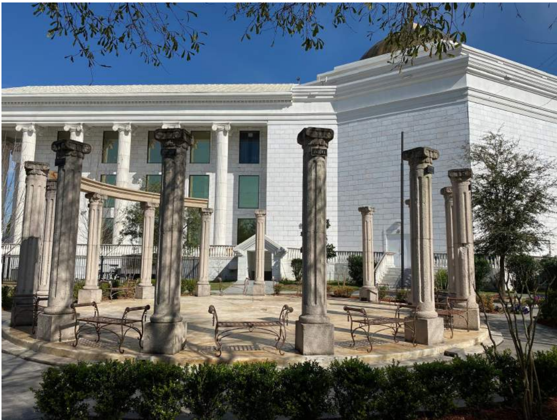
Figure 1. The monument of apostolic columns, La Luz del Mundo Temple, Houston.

While participating in this restorationist agenda, La Luz del Mundo made two important adjustments. First, the church restored not just the Apostolic Faith in its teachings and practices, but also the apostolic office. The Apostle Aarón and his successors in office are seen as having a special relationship with God and as guiding the church from the knowledge that they alone have received from God the Father and Jesus Christ. The Apostle Aarón and his successors Samuel (1937–2014) and Naasón (b. 1969), are by no means objects of worship, but they have been assigned the highest status in the community and shown respect and deference comparable to that given the original twelve apostles. The great esteem in which the Apostles are held is made visible in each local church, where some prominent acknowledgement of the Apostles as the columns that uphold the church is usually integrated into the front of the main sanctuary. In Texas, at the lead church in Houston, constructed during the tenure of the second Apostle Samuel, a monument of 14 columns was erected—12 for the original apostles and two for the Apostle Samuel and his predecessor.