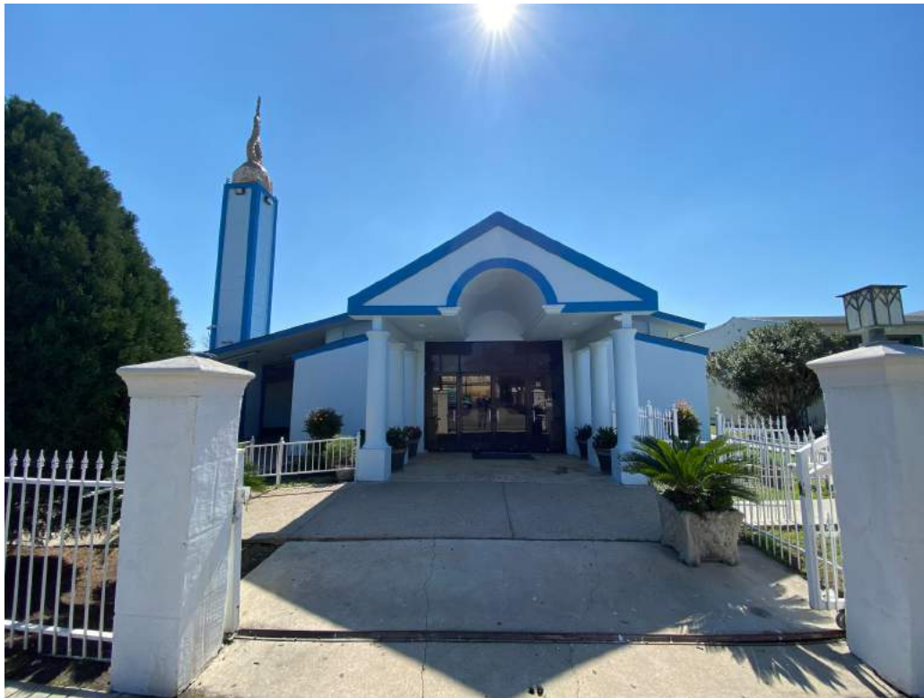
Figure 2. La Luz del Mundo San Antonio Temple.

beginning in Texas is dated from this seemingly humble event. San Antonio had become Mexican America's most important center in Texas, and the congregation would grow steadily, emerging as the center from which the Church would initially expand across the state.