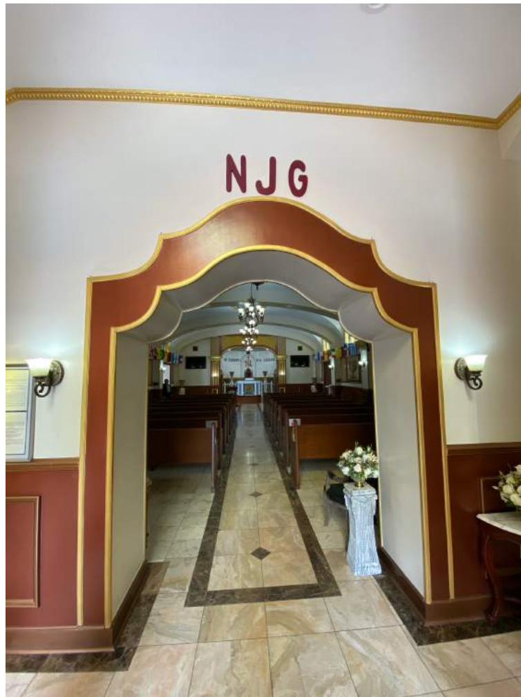
Figures 4. Initials of Apostle Naasón Joaquín García, at entrance to downtown LA temple, January 2020.

years before rotating to a new location to be determined by senior LLDM leadership.