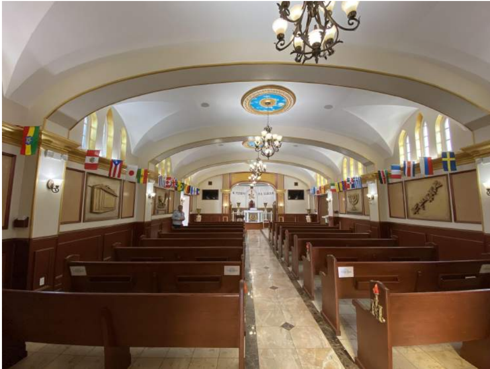
Figure 3. Interior, downtown Los Angeles temple, January 2020.

The temples in downtown Los Angeles and Long Beach are two stories tall and include ornate decorations and Jewish and Christian iconography on the walls. Notably, the initials of the current Apostle, Naasón Joaquín García, are found in the main sanctuaries (see figure 4), just as they are in East LA, as a sign of respect for the leader. In fact, I noticed that the stylized initials NJG likewise formed the basis of a sticker found on the back of LLDM members' cars as well, which serves as an outward identifier that has religious utility in the car-driving culture of California. Another distinguishing feature, common to all the temples I visited, is the placement of a seat of honor reserved for the Apostle Naasón in front of the altar. The pulpit in each temple, one notices, is set off to the side of the stage, which I am told serves to emphasize the elevated status of the Apostle in relation to the local minister and other speakers. I was also struck by the prominence, at the entrance of the temples, of hand sanitizers to ensure cleanliness and purity once in the temple. Even more striking, however, is the placement of lion statues (with the paw held up) in some temples, such as East Los Angeles and downtown Los Angeles. Finally, I was intrigued to learn that each temple has a neighboring or nearby house for the minister and his family. Full-time ministers serve for three