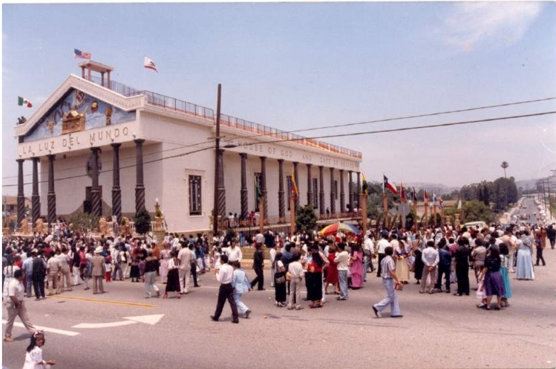
Figure 1. East Los Angeles temple, 1985 inauguration.

decades earlier). LLDM's earliest ecclesiastical presence was a house church located at San Pedro and 87th Street (Estrada 2020), and indeed house churches continue to function as mission locations in areas where temples are too remote. Members soon outgrew this location, however, and relocated across the street from the future location of the LLDM temple in East Los Angeles. The church continued to expand, and in the early 1970s LLDM purchased land at 112 North Arizona Avenue, where church members built the current temple themselves, drawing from the skills and strengths of the membership that lived in the surrounding area. The East Los Angeles temple seats over 1,000 and was inaugurated by LLDM's second Apostle, Samuel Joaquín Flores (1937–2014), in 1985 (see figure 1). In 2005, Apostle Samuel visited the church in Los Angeles to celebrate the 50 th anniversary of LLDM's ministry in the area.