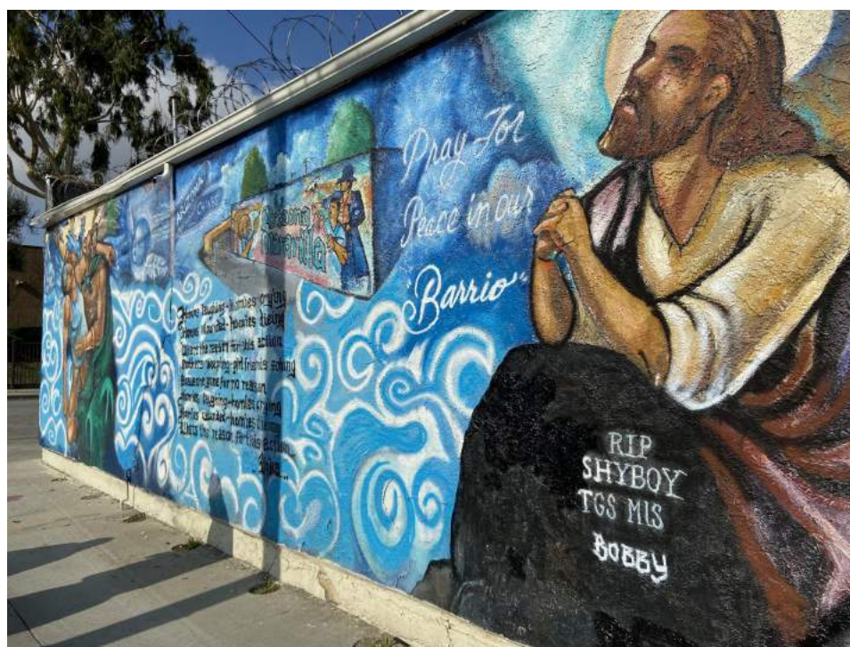
Figure 5. Mural in an alley near East LA temple, January 2020.

The neighborhood around Arizona Avenue was once the site of intense and ongoing gang violence, especially between 1970 and 2000, with rival gangs positioned on their own side of the block, with the temple caught directly in between (Estrada 2020). As more LLDM members moved into the area, they initiated a “beautification project” (Estrada 2020), in which gang safe houses were purchased and, slowly but surely, crime rates decreased in the area (corroborated by Los Angeles County Sheriff’s Department 2012; Los Angeles County 2018; Los Angeles Police Department 2020; Federal Bureau of Investigation 2020), property values rose (Los Angeles County Office of the Assessor, 2020; Zillow 2020a, 2020b), and new businesses opened (recent examples I discovered were Subway, Denny’s, and a number of local markets). The church received recognitions of its service to the community from the County of Los Angeles (Burke 2001) and Governor of California (Davis 2003). I discovered a vestige of this gang history in an alley that featured a mural—not produced by LLDM members, I am told—lamenting the senselessness of gang violence and the lives lost in decades past (see figure 5).