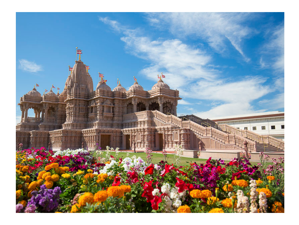
Figure 1. The Swaminarayan BAPS Temple in Los Angeles.

elements of Hindu life abroad with the tightly organized BAPS group jumping out ahead of the others. In fact, BAPS has developed such a high profile in the West that even many Hindus are unaware that the other elements of the Swaminarayan movement exist, or that they are now present in some strength in the West, especially England, the United States, and Canada.