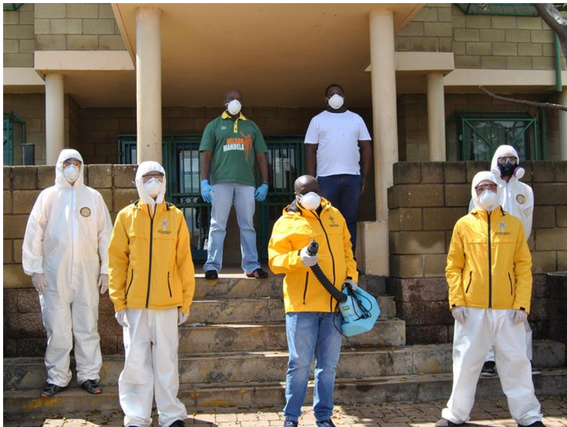
Figure 2. Mayor Francis Makgatho of Mogale City, South Africa, with a Volunteer Minister yellow jacket, among the Volunteer Ministers who disinfected the local library.

Critics also questioned the effectiveness of the Volunteer Ministers’ sanitization activities, ignoring that they used the same technologies adopted by several governments, and that the Ministers were praised by majors and other authorities ( Krugersdorp News 2020; Randfontein Herald 2020b).