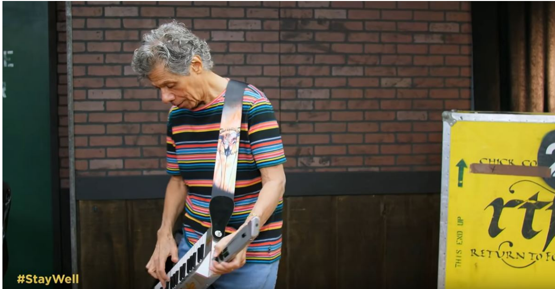
Figure 5. Chick Corea in the “Spread a Smile, Stay Well” video.

again Corea and Clarke, virtually came together and sang and played jointly, each from his or her home. When I last accessed the video on May 23, 2020, YouTube indicated that it had exceeded 10 million views (“Spread a Smile, Stay Well” 2020).