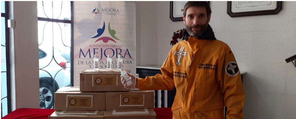
Figure 1. A Volunteer Minister in Madrid shows the disinfectant gel to be donated to the local police.

In several cities, Volunteer Ministers disinfected public facilities. For example, in Rand West City, in the South African province of Gauteng, Volunteer Ministers disinfected the Public Safety Department in Randfontein and Westonaria (the two municipalities whose merger resulted in Rand West City), the Rand West City Civic Centre, the Old Westonaria Municipal Offices, the Randgate Clinic, the Westonaria Shelter for the Homeless, and the Westonaria Library ( Randfontein Herald 2020a). In the Gauteng province, Scientology mobilized 233 Volunteer Ministers, split in 18 teams (Bosch 2020).