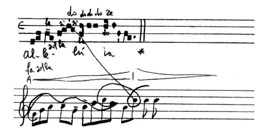
Example of chironomic line realized by Palamidessi (Palamidessi n.d. [post-1975b], II, 23).