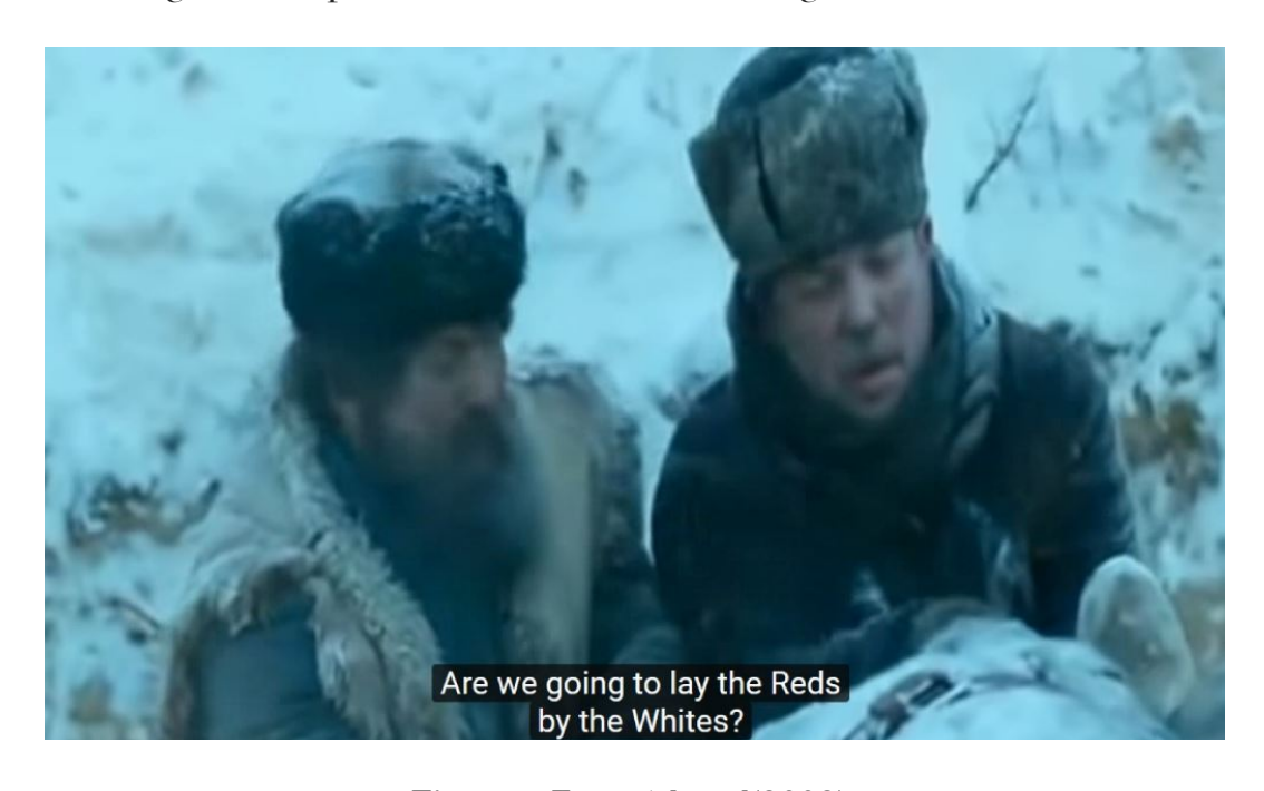
Figure 3. From Admiral (2008).